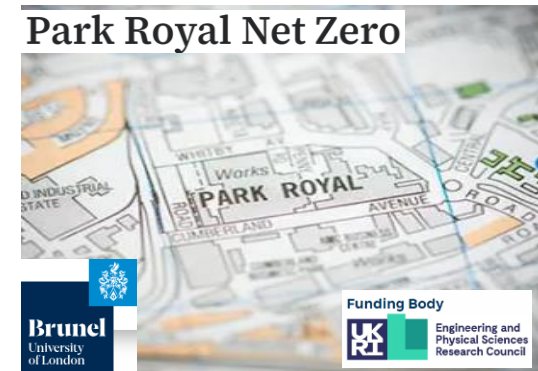
Brunel's Net Zero Food Systems