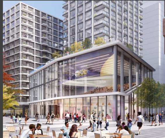
Imperial College & West Tech London